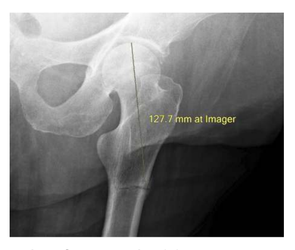
Fig. 3. Subtrochantic left femur 3 months after Fig. 2