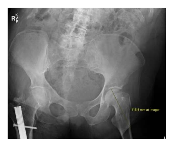
Fig. 2. Pelvis 3 months after the 5<sup>th</sup> denosumab injection

The next day an intramedullary nail was placed and the patient had an uneventful recovery. However, because of concerns about the persistence of the antiresorptive effects of her bisphosphonate medication, her doctors the recommended beginning denosumab treatment again. The patient declined this option but began a second course of teriparatide about 6 months after her last femur fracture based on the argument that she was "still fracturing". She continues on that medication at the time of this publication.