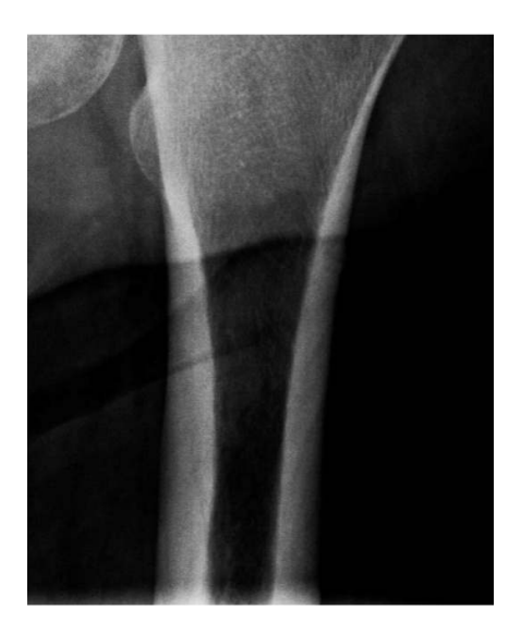
Fig. 1. Subtrochanteric femur after the fall

Thereafter she consulted an osteoporosis specialty clinic and was advised to begin denosumab 60mg subcutaneous injections twice yearly, presumably for preservation of her anabolic gains. About 3 months after the 4<sup>th</sup> injection, she fell from a standing height, incurring a periorbital ecchymosis and some left hip pain. She was evaluated by a plain film of her left hip at that time. The film (Fig. 1) shows possible femoral shaft cortical thickening but no evidence of pelvic or proximal femur fracture. This radiograph was compared to the next report 3 months later and the absence of any fracture in the post-fall study was confirmed.